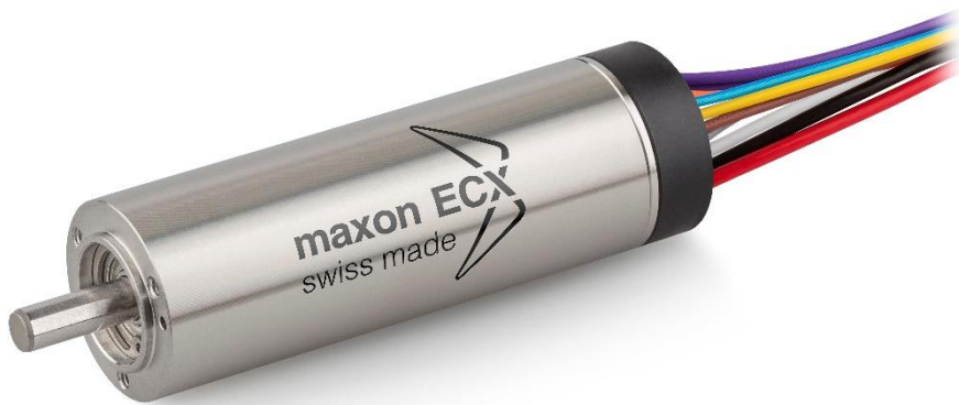
ECX SPEED 19 L: The brushless DC motor for high speeds.