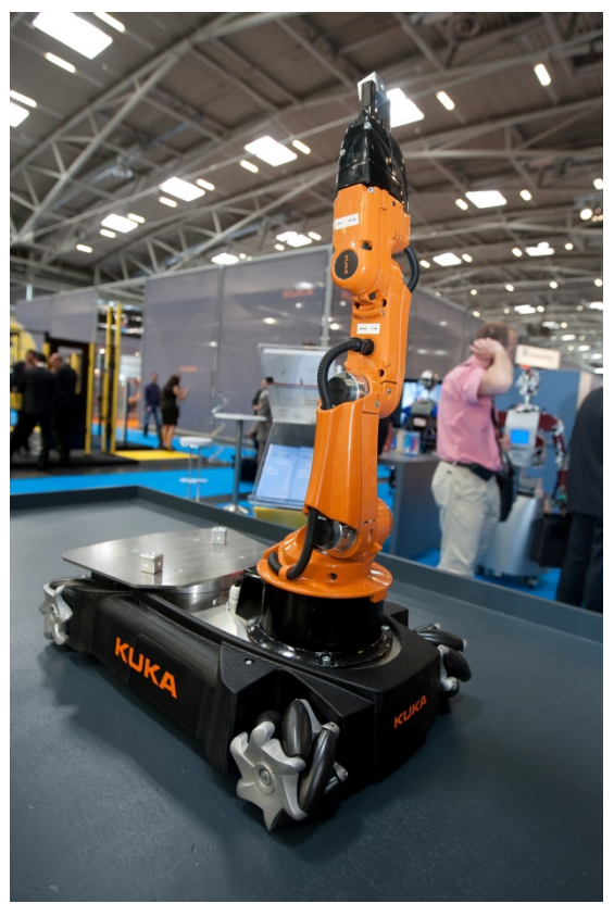
Figure 2: The robot's control software is a Linux-based open-source system equipped with various open interfaces.

Author: Anja Schütz, Redaktorin maxon motor ag Application story: 4071 characters, 642 words, 4 figures